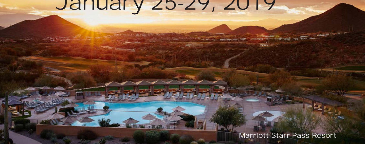
Marriott Starr Pass Resort

Bring your cowboy hats and join us for a fabulous four-day weekend in Tucson, Arizona. We'll be staying at the beautiful Marriott Starr Pass Resort in the mountains of Tucson. Upon arrival Friday evening, we'll enjoy a family hoedown at the Catalina Grill.