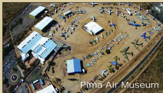
Pima Air Museum