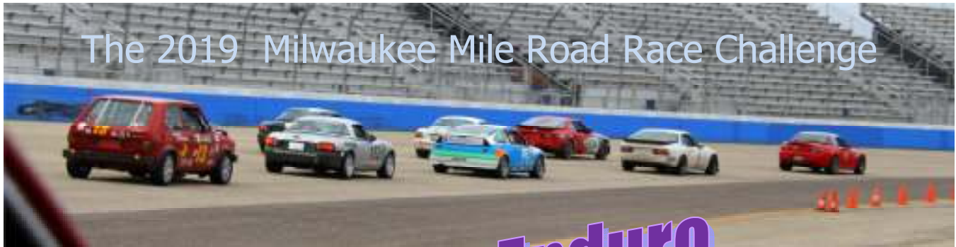
The 2019 Milwaukee Mile Road Race Challenge