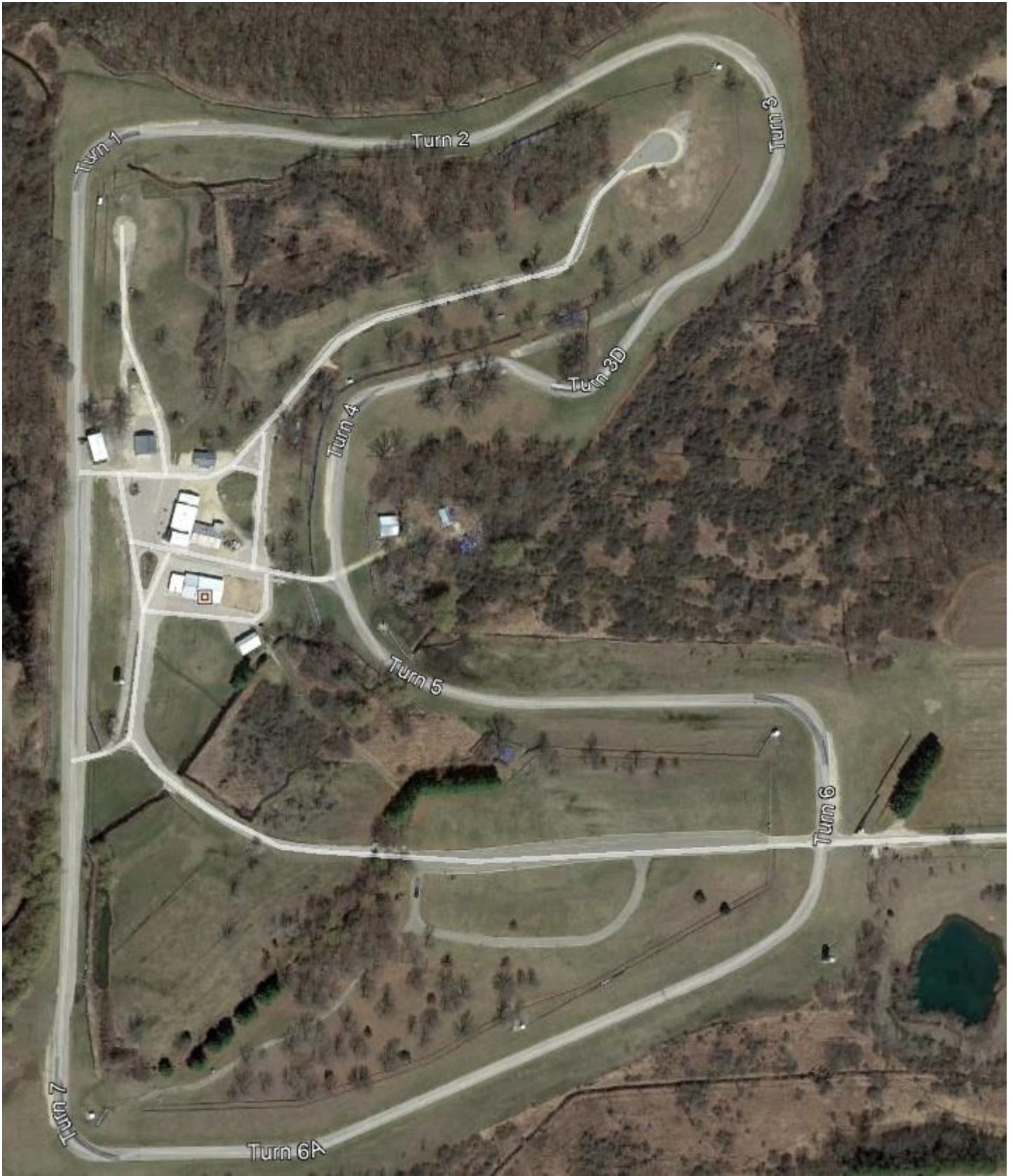
Blackhawk Farms Raceway