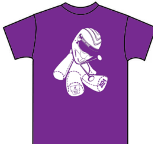
Back of T-shirt