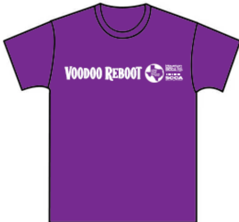
Front of T-shirt